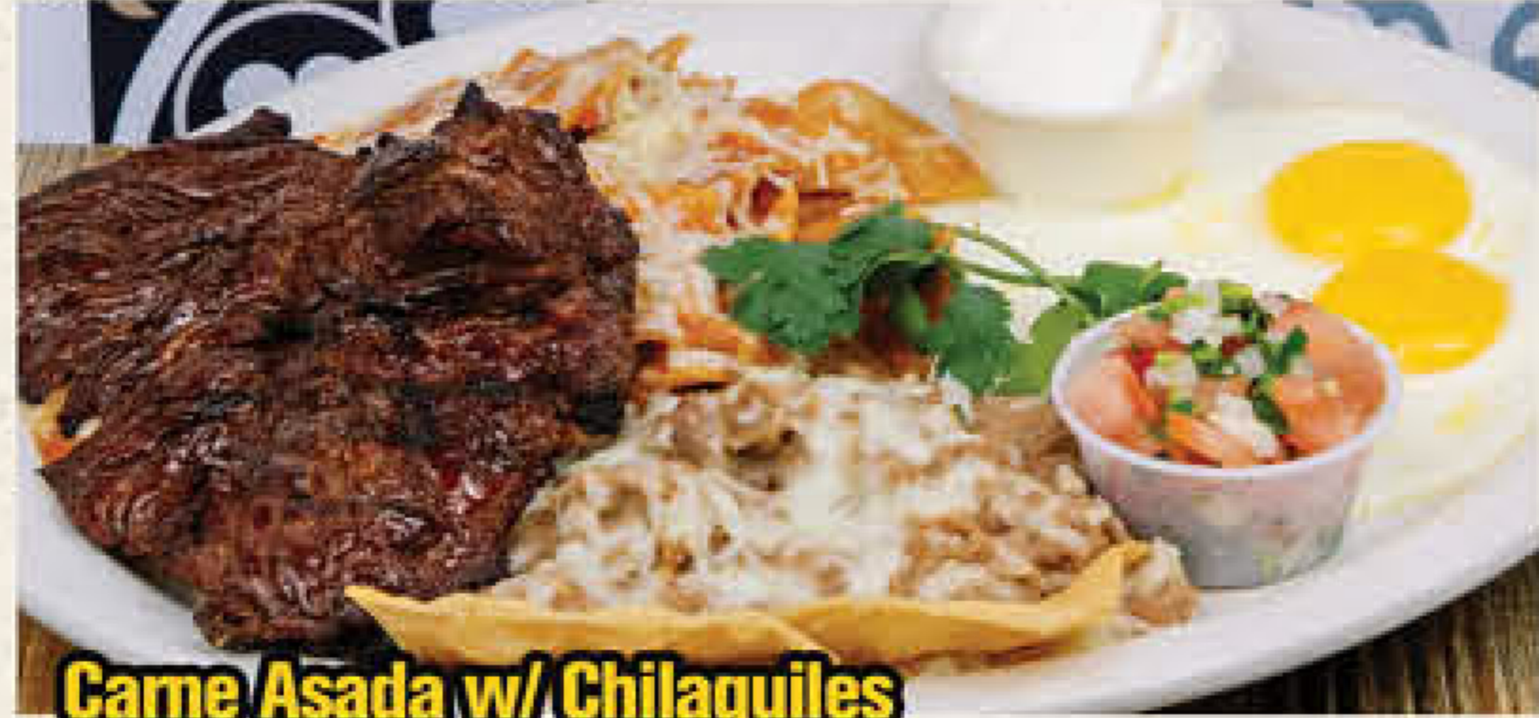
Carne Asada w/ Chilaquiles