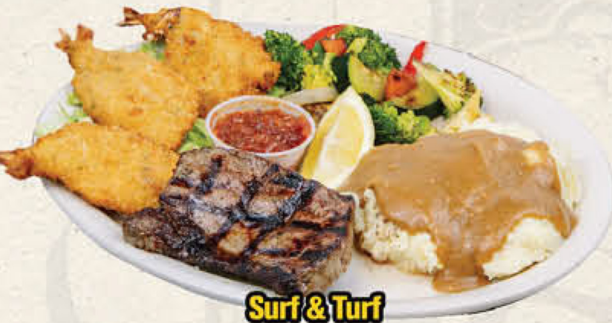
Surf & Turf