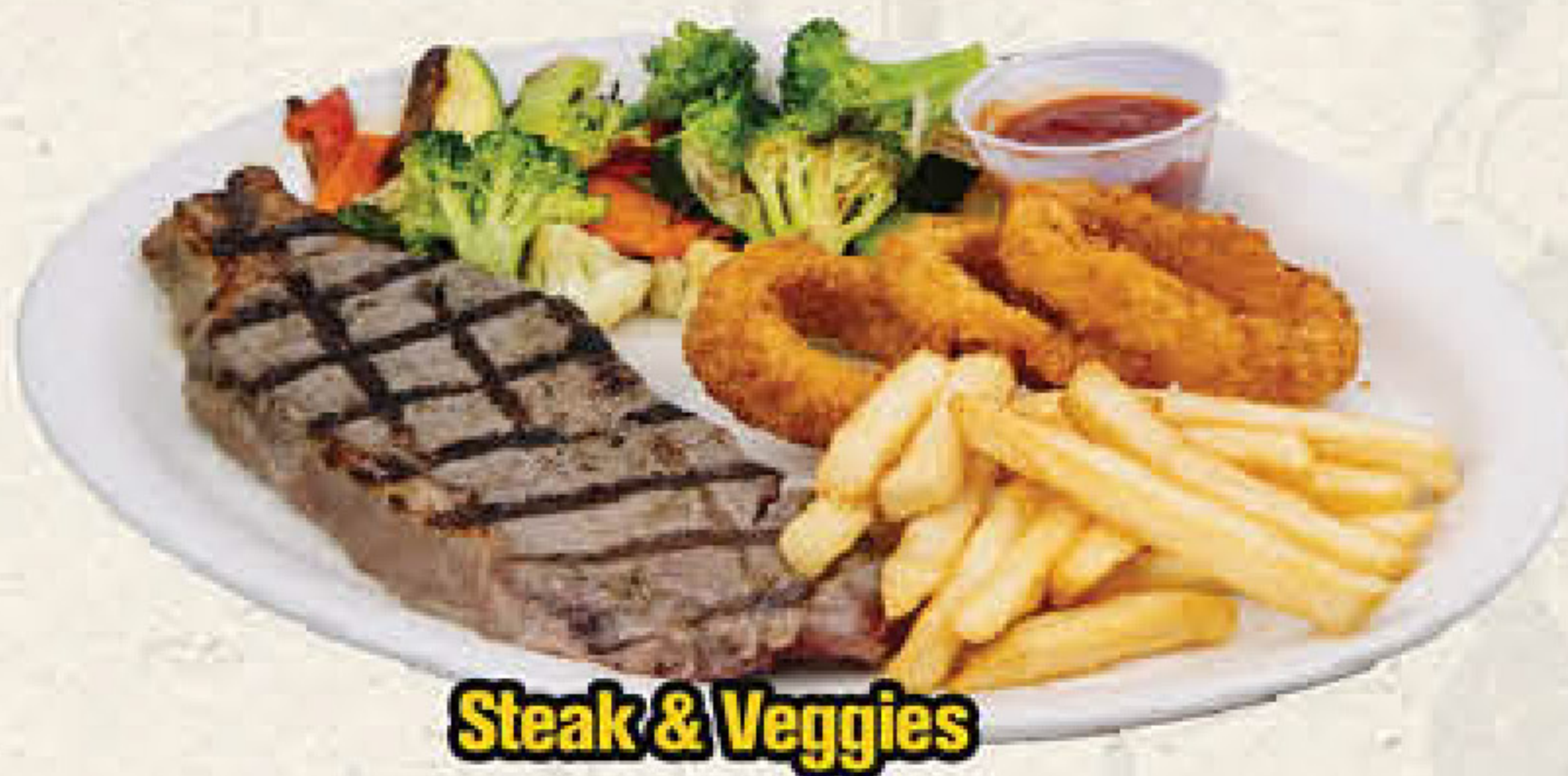
Steak & Veggies