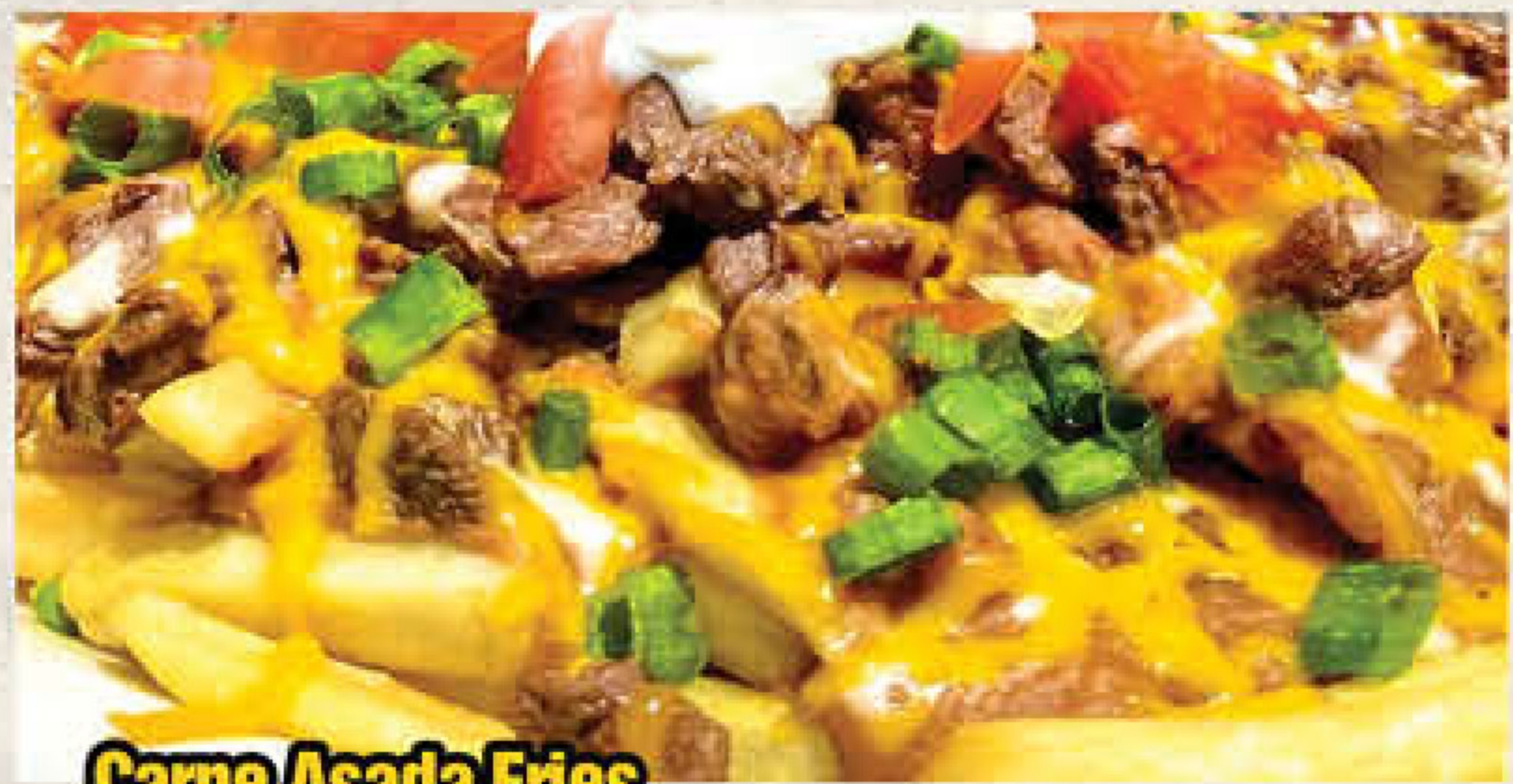
Carne Asada Fries