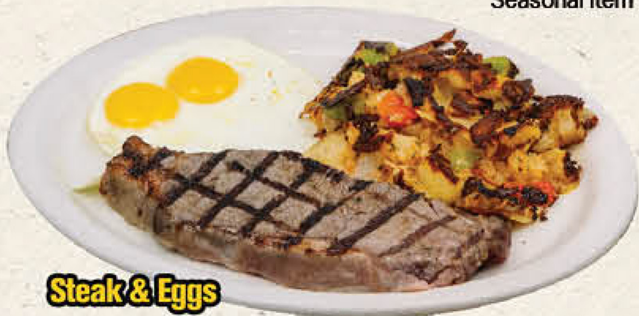
Steak & Eggs