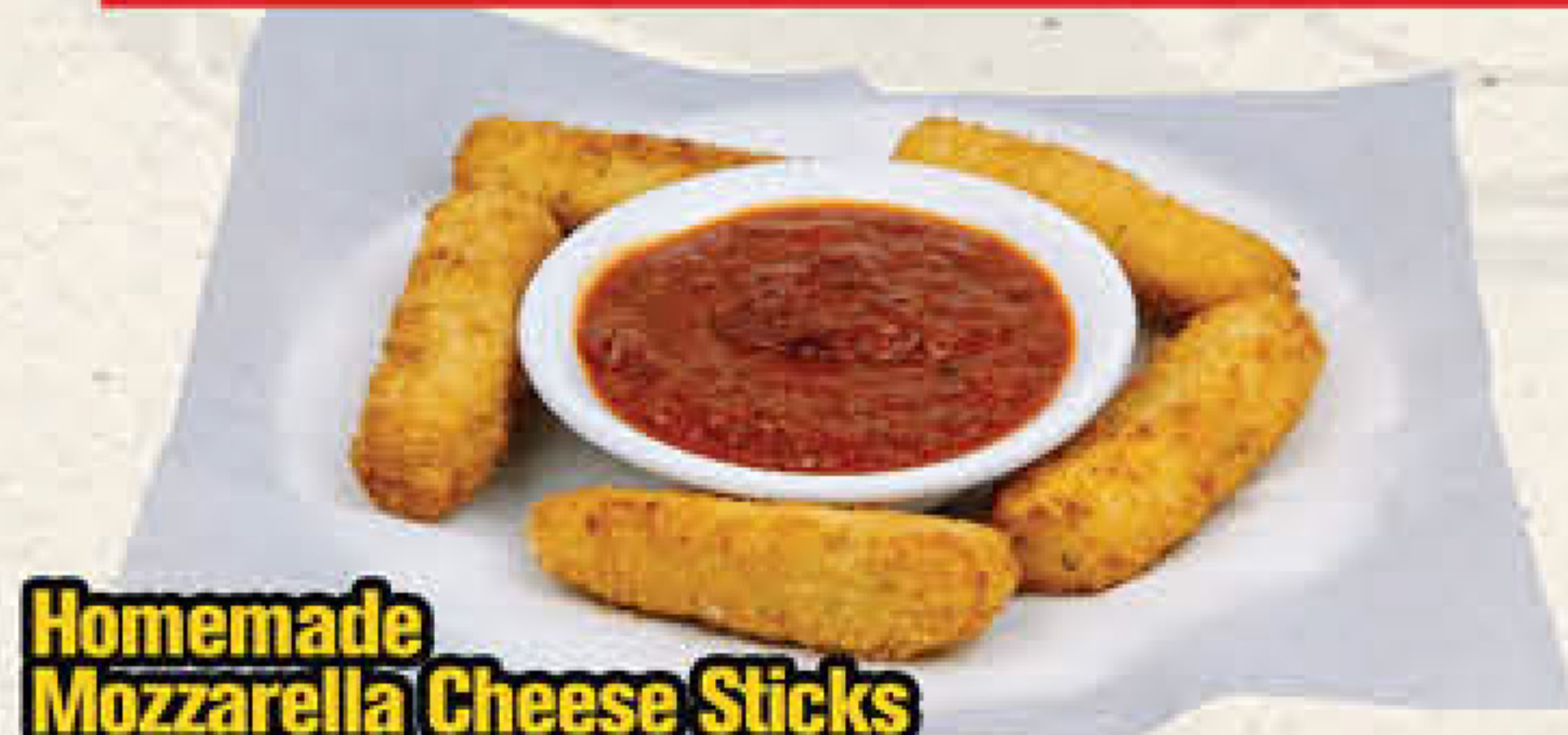
Homemade Mozzarella Cheese Sticks