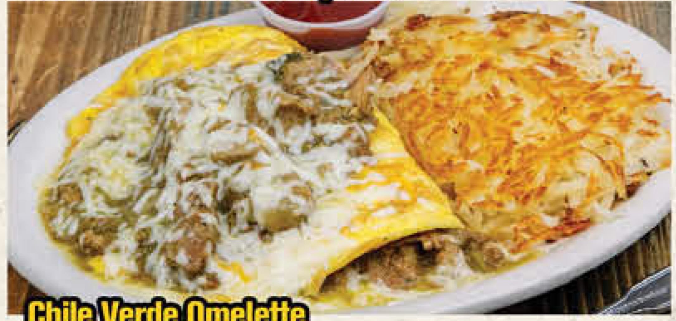
Chile Verde Omelette