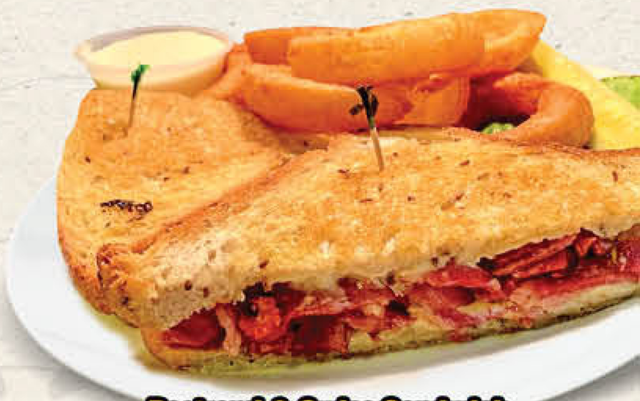
Pastrami & Swiss Sandwich