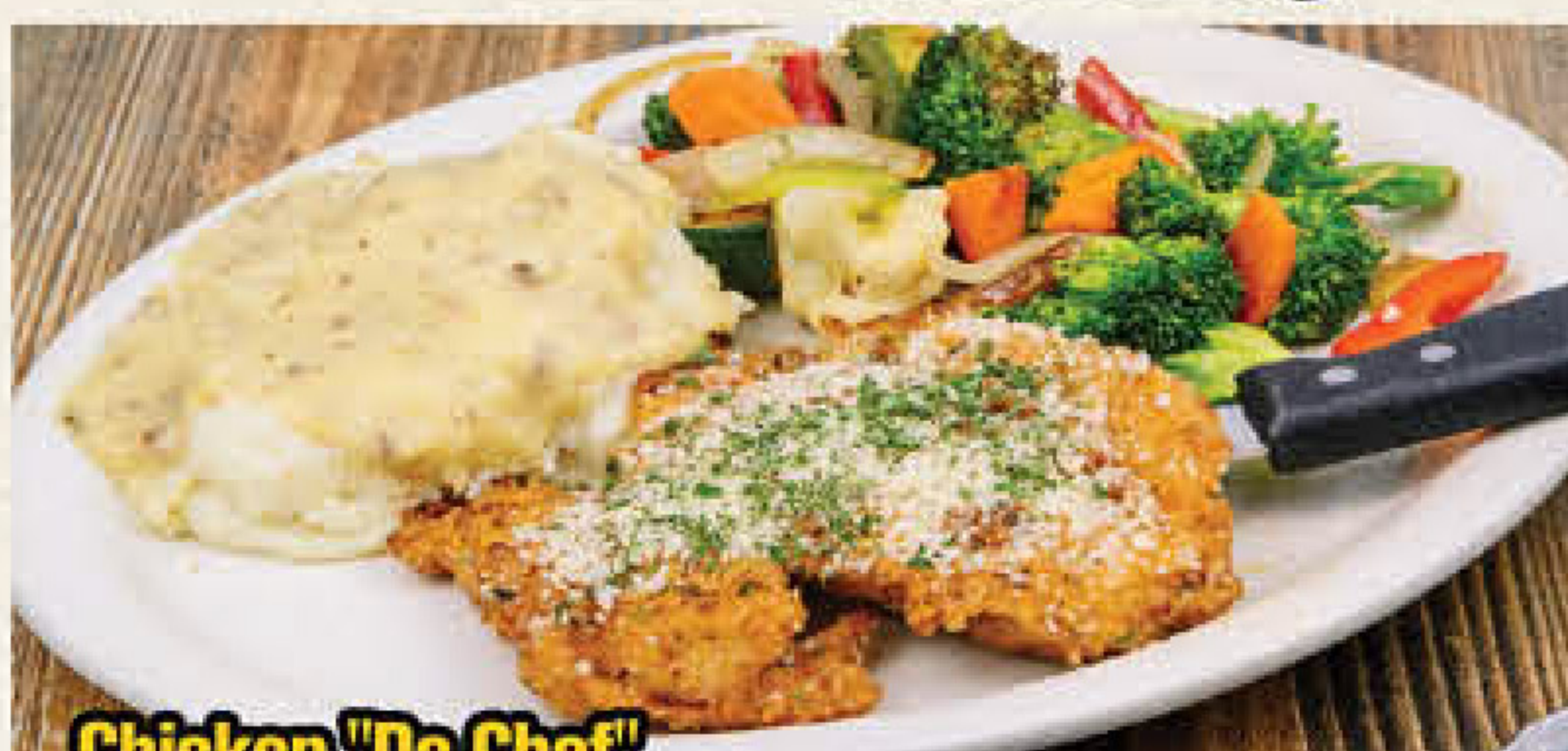
Chicken "De Chef"