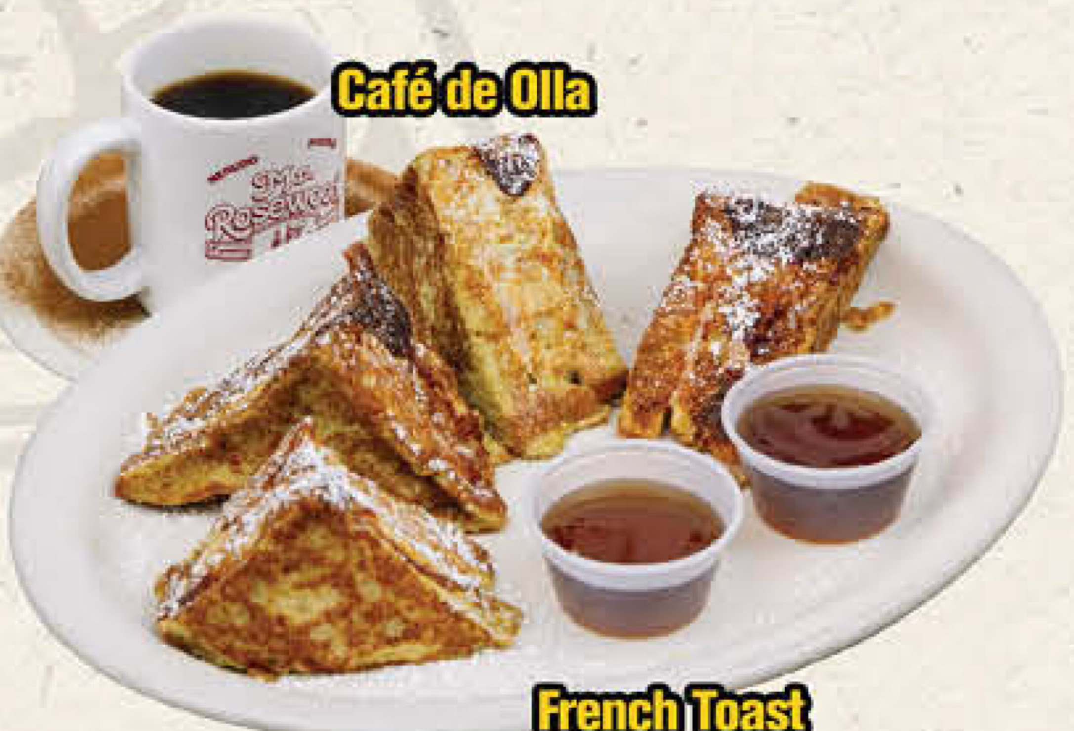
Café de Olla