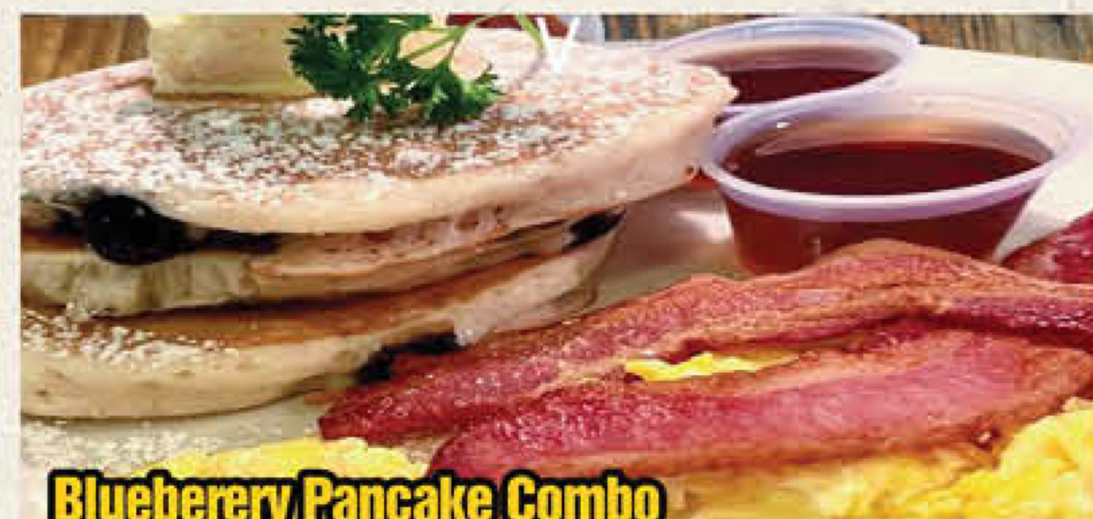
Blueberery Pancake Combo