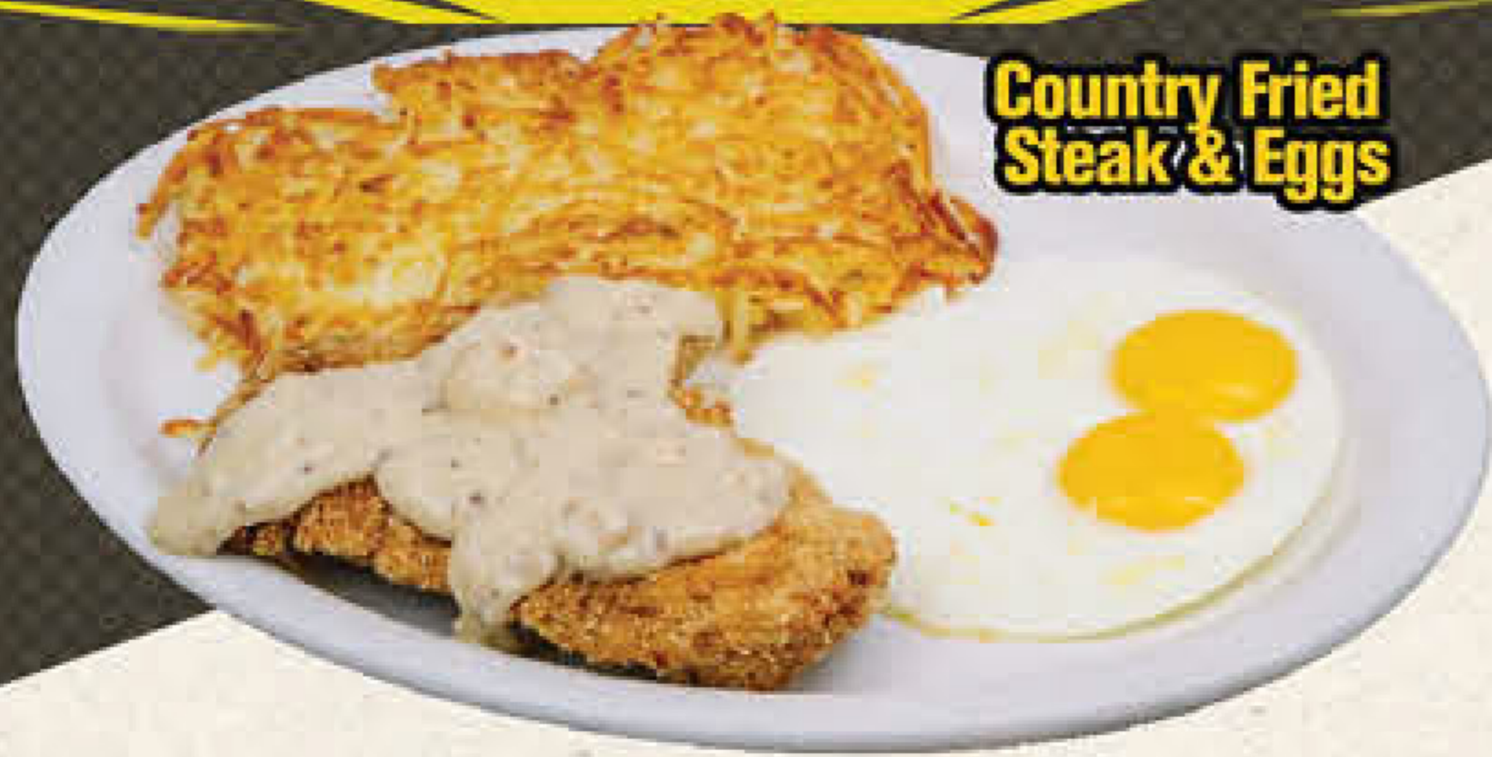
Country Fried Steak & Eggs