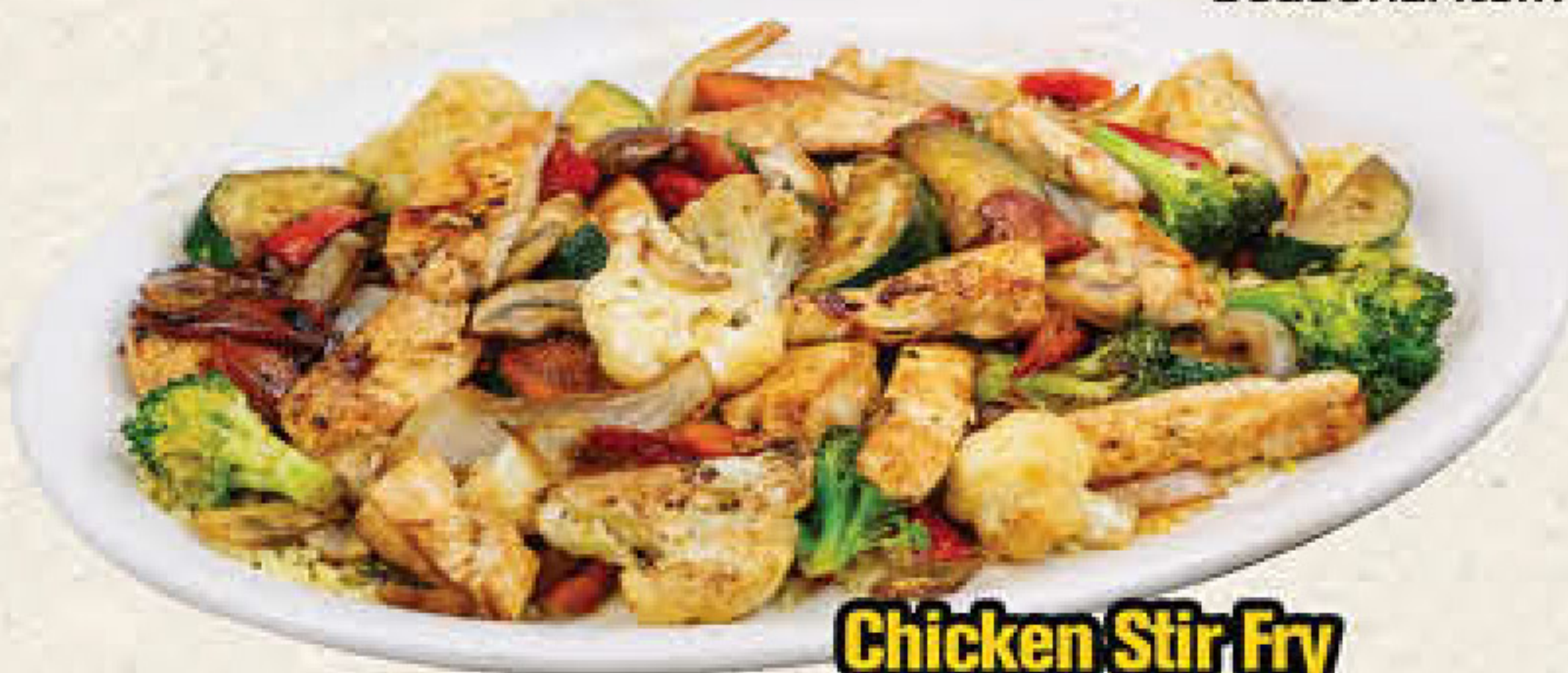
Chicken Stir Fry

NOTICE: Consuming raw or undercooked meats, poultry, seafood, shellfish or eggs may increase your risk of foodborne illness, especially if you have certain medical conditions.